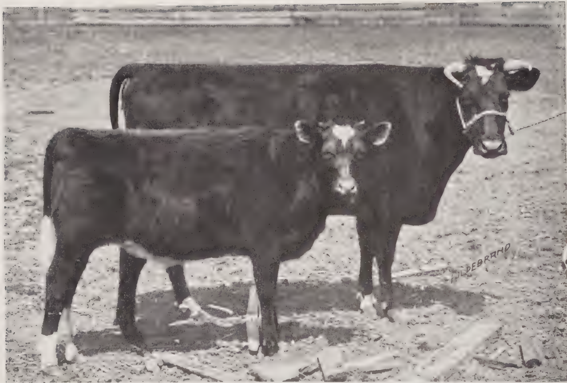
PARKDALE VICTORIA AND HEIFER CALF.